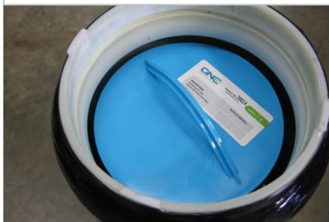
A properly installed filter should sit below the seal area.