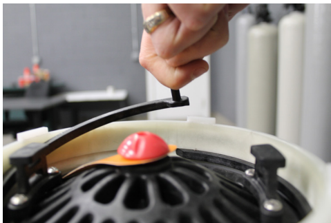
Remove top cap first.