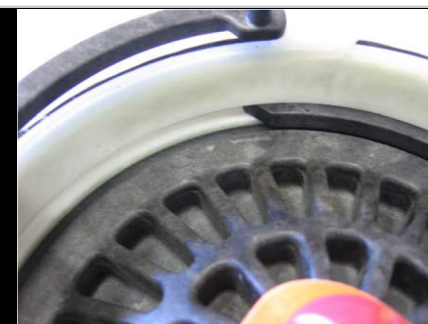
Install the angled lead tip of the retaining ring into the groove.