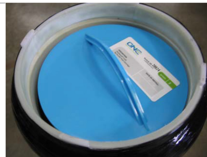
A filter this high is not installed properly.