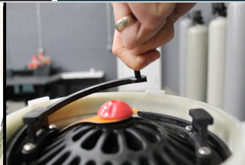
Remove snap ring and tank top from tank.