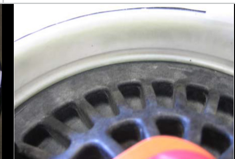
Ensure the top Pressure Release Cap Lid is installed to fully expose the retaining groove.