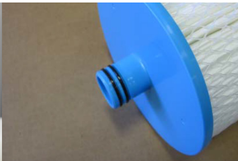
Ensure o-rings are properly lubricated before installation. Insert filter into the filter adapter of the bottom drain assembly.