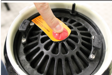
Remove top cover and relieve pressure in tank by pressing red button.

Note: After filter installation or replacement the water will look "milky" or "cloudy". This is due to micro bubbles from the filter being released into the water. They are just tiny air bubbles and are harmless. The bubbles will go away after the first few hours after installation.