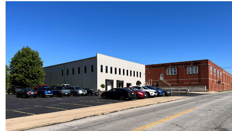
710 Orange Street Office and Manufacturing Building

Our CSI Water team is dedicated to improving water quality through the development of water treatment products, design engineering services and educational programs to provide the utmost in quality and support for our valued customers.