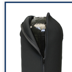
SHARK SKIN JACKETS