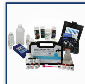
WATER TEST KITS