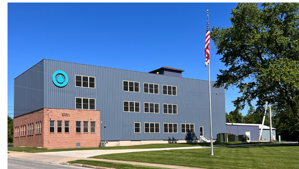
220 Ohio Street Technology Center

Phone: 888.363.9434 Phone: 419.281.6829 www.csiwater.com