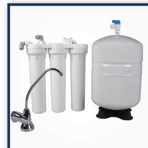
TFC-3 REVERSE OSMOSIS DRINKING WATER SYSTEM